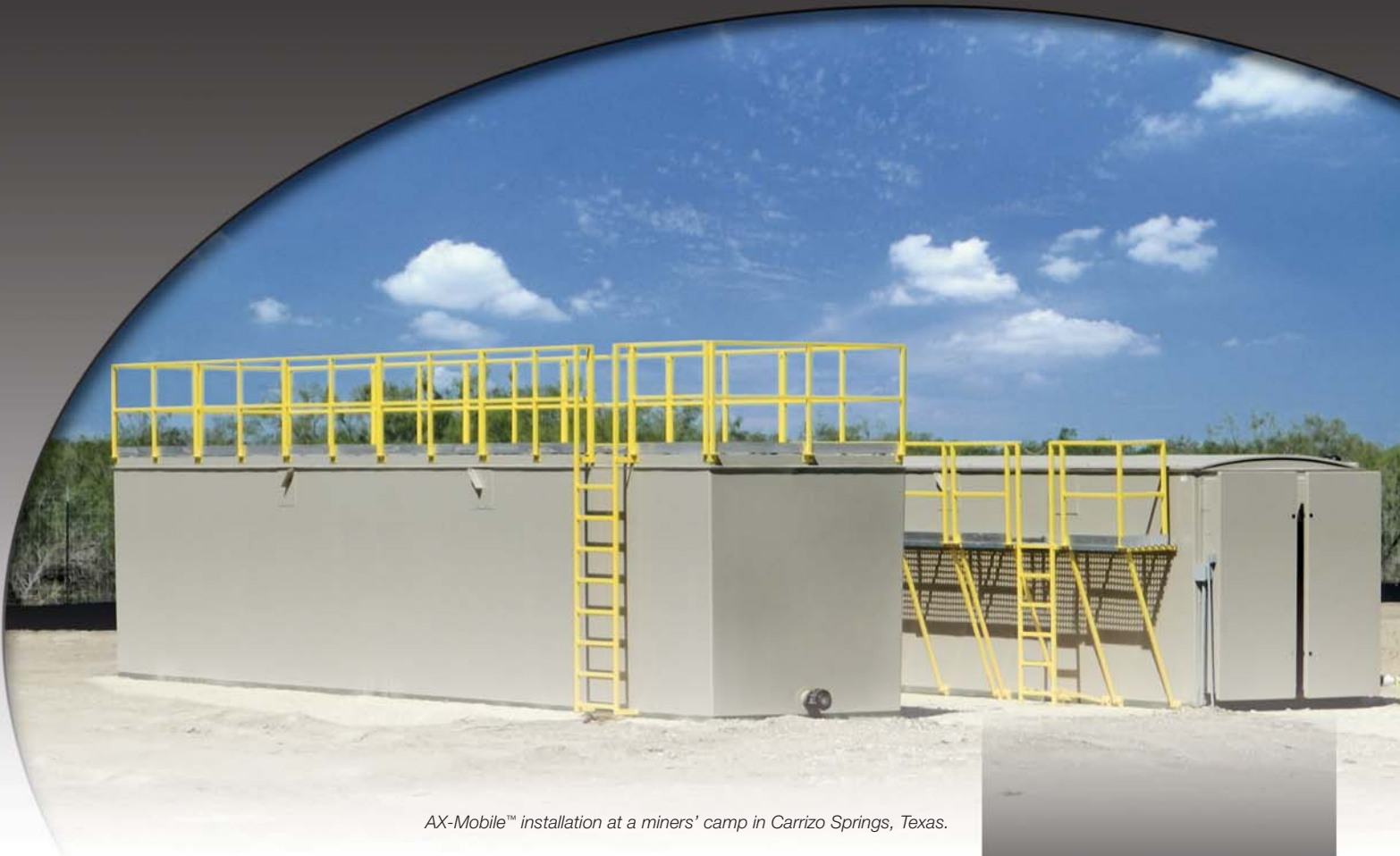
AX-Mobile™ installation at a miners' camp in Carrizo Springs, Texas.