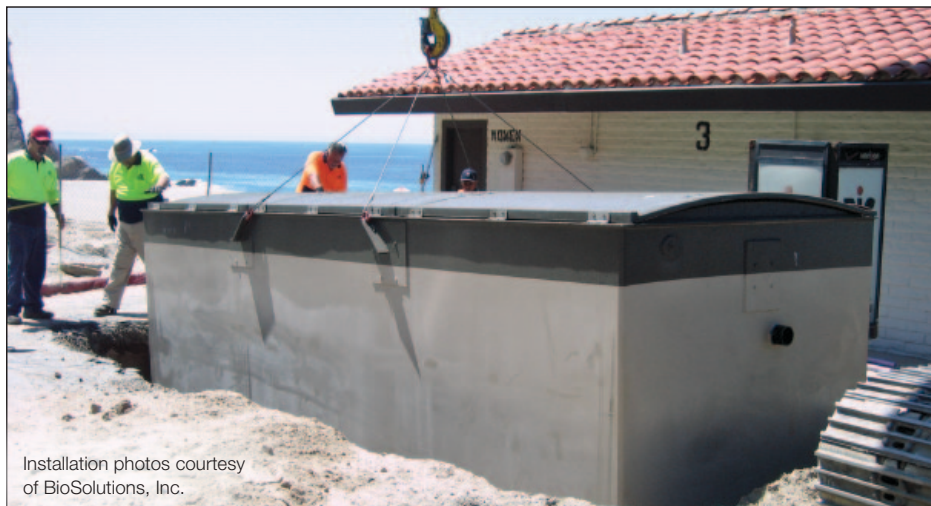
Installation photos courtesy of BioSolutions, Inc.