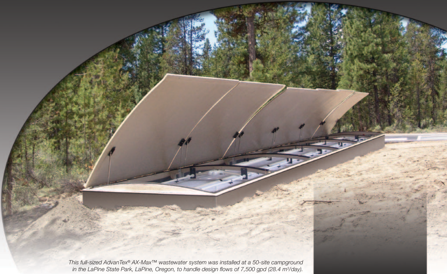
This full-sized AdvanTex® AX-Max™ wastewater system was installed at a 50-site campground in the LaPine State Park, LaPine, Oregon, to handle design flows of 7,500 gpd (28.4 m³/day).