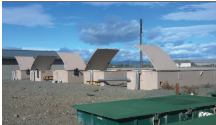
The Yakama Nations Housing Authority in Washington state added five AdvanTex® AX-Max units (background) to its ten AdvanTex AX-100 units, increasing the capacity of its wastewater system by 50%.

Orenco's newest product in the AdvanTex line is the AX-Max™: a completely-integrated, fully-plumbed, and compact wastewater treatment plant that's ideal for commercial properties and communities. It's also ideal for projects with strict discharge limits, limited budgets, and part-time operators.