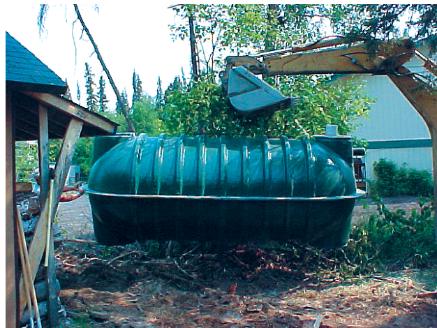
Orengo Fiberglass Tank being installed as part of an AdvanTex Treatment System