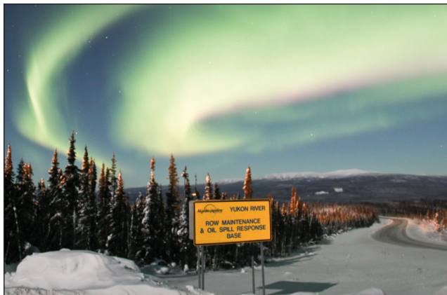
Alyeska Pump Station 6 is located on the Yukon River in Alaska, just south of the Arctic Circle.

Alyeska's Yukon Response Station/Pump Station 6 is located three hours north of Fairbanks, on the Alaska Pipeline near the Yukon River. It serves as a remote base for firefighting teams in the summer, and for pipeline monitoring staff year-round. Temperatures can range from the 90's (35° C) in the summer to -60° (-50° C) in the winter. Also, the ground is permafrost, so infrastructure has to be installed above-ground. Alyeska needed a wastewater solution that could address the site's temperature extremes and installation parameters.