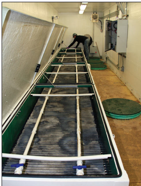
The insulated control room allows for easy maintenance regardless of weather conditions.

Alyeska’s AX-Mobile also includes an optional control room built over the treatment system. Varney continues, “It can be kind of a spooky place out there when it’s 20 below (-30° C) and dark. But that control room is always warm and toasty.” The control room